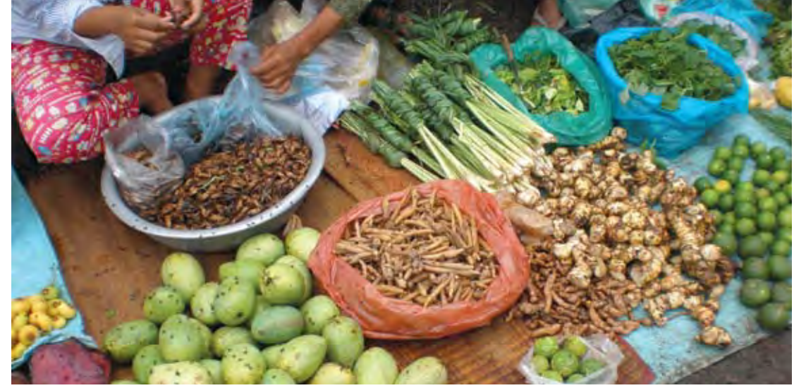
Open air markets, Kampong Thom, Cambodia