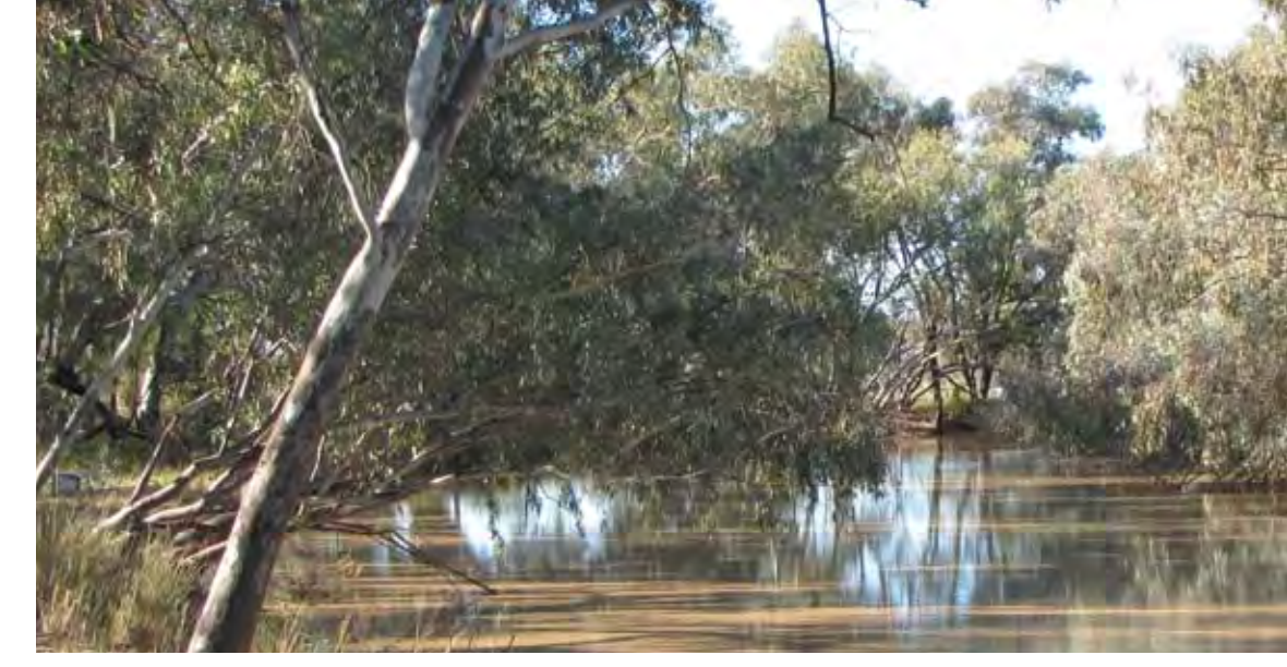
Nebine River at Murra Murra, QLD