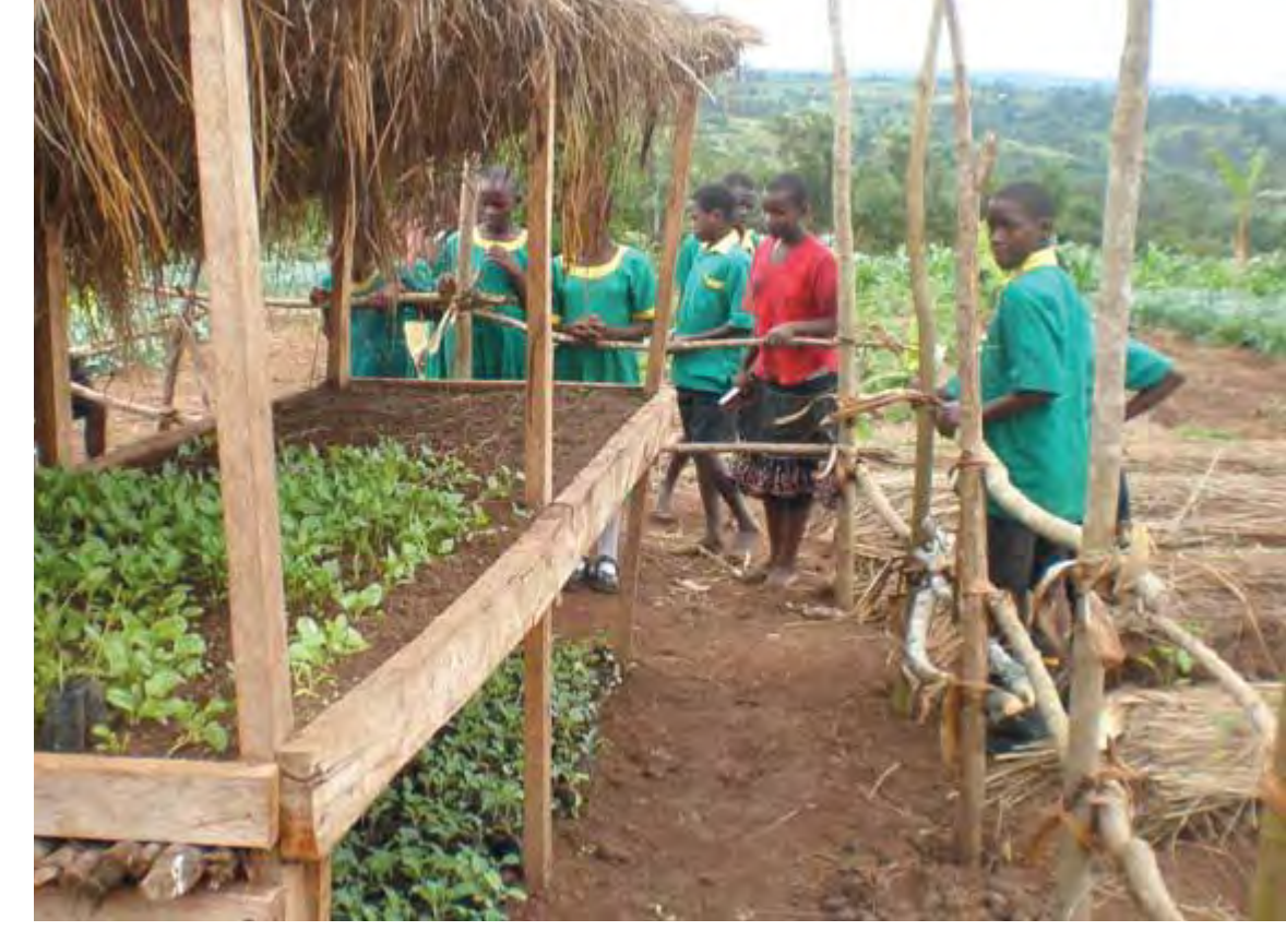
Kikunge Kiwani Primary School plant nursery with seedlings ready to be planted, Uganda